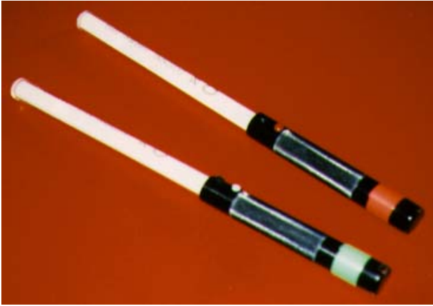
Figure 1. The infrared batons used in the WorldBeat exhibit.

On the user interface side, we met the requirements by using two infrared batons (see Figure 1) that deliver 2-D position information with an additional action button for special functions. They are used for all interaction with the exhibit, making the interface very consistent.