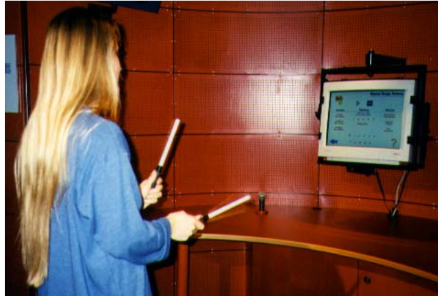
Figure 2. A visitor using the WorldBeat exhibit in the Ars Electronica Center.